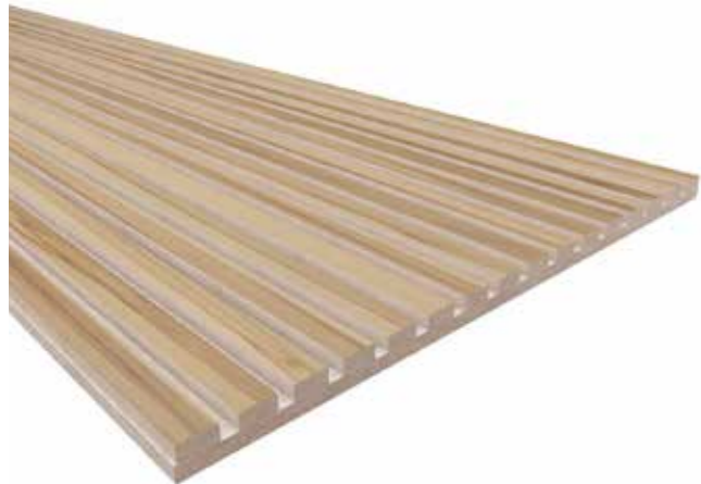
BEACH / OPAL BACKING