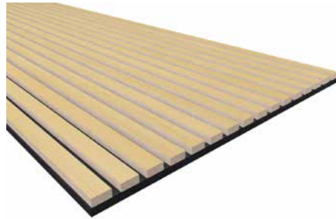
ASH / CHARCOAL BACKING