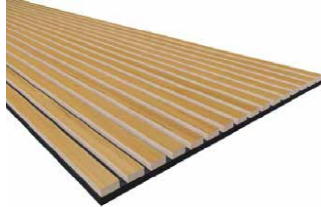
OAK / CHARCOAL GREY BACKING