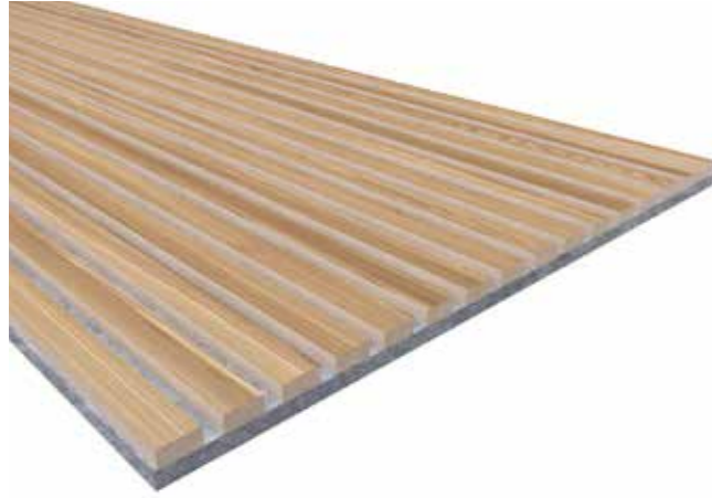
LARCH / ICE WHITE BACKING